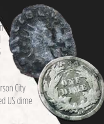
Rare 1876 Carson City minted US dime